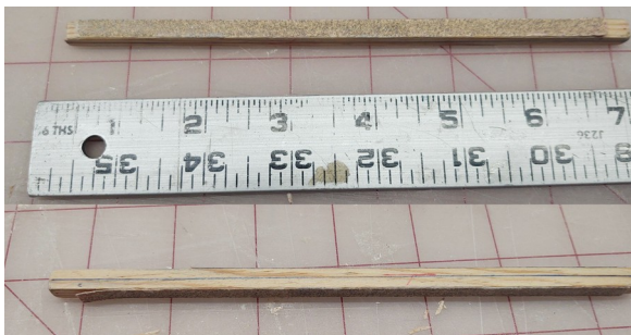
(Left) Composite shot of spar sanding block top & side. Note thin blue line marking spar depth in the lower shot.

Tomorrow should bring getting started on sheeting the wing leading edge tops and, maybe, the trailing edge and ailerons. We'll see!