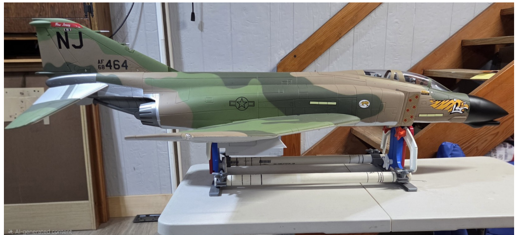
Right: After the decals, ready for the maiden flight!