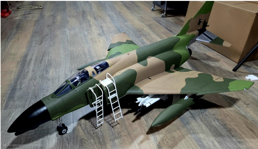
Left: Before adding the decals.....

Speaking of maiden flights, one feature of the FrSky radio series I've found very useful is FrSky's Instant Trim . Instant Trim simplifies model trimming an RC model by using a momentary switch to instantly apply the current stick positions as trims for elevator, aileron, and rudder simultaneously. No trying to hit trim buttons whilst trying to keep a model in the air or calling for a friend to hit the buttons (not that the F-4 was a problem, needing just a couple of clicks of elevator to lock her in). ( Now that sounds like a very useful feature! Ed. Bill )